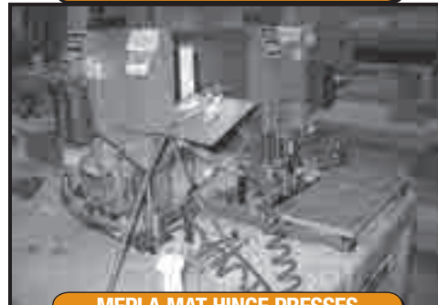
MEPLA MAT HINGE PRESSES