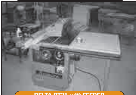
DELTA RT31 with FEEDER