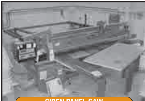
GIBEN PANEL SAW