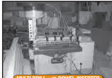
MULTI DRILL with DOWEL INSERTER