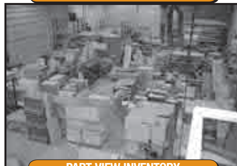
PART VIEW INVENTORY