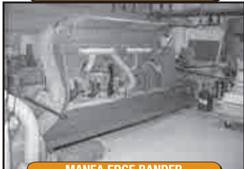
MANEA EDGE BANDER