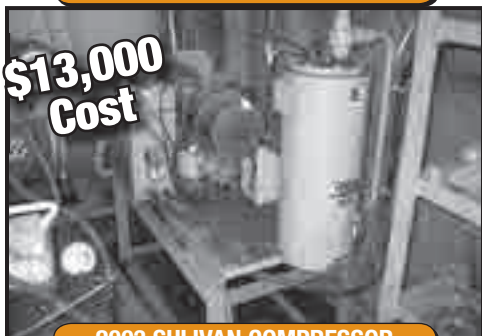
2003 SULLIVAN COMPRESSOR