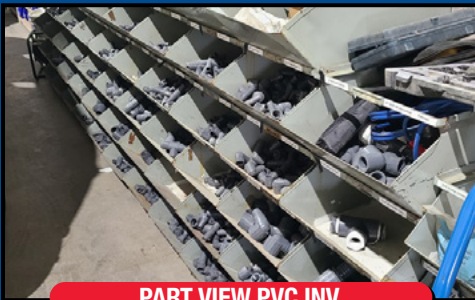
PART VIEW PVC INV.