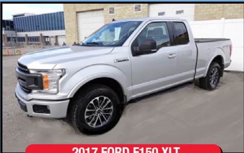
2017 FORD F150 XLT