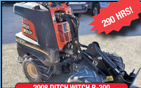
2008 DITCH WITCH R-300