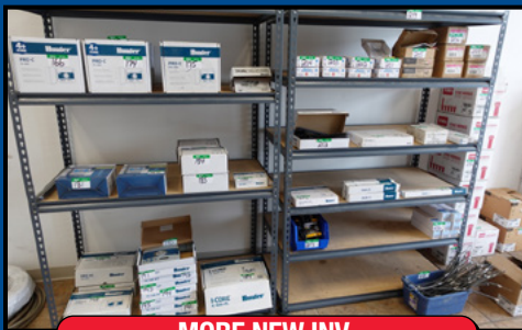
MORE NEW INV.