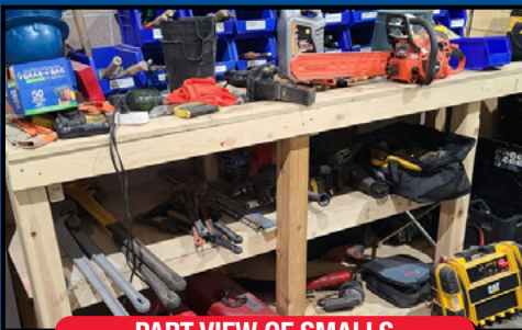
PART VIEW OF SMALLS