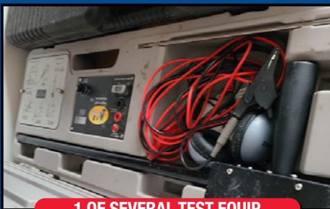
1 OF SEVERAL TEST EQUIP