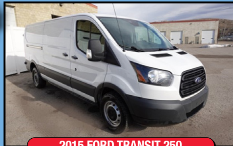
2015 FORD TRANSIT 250