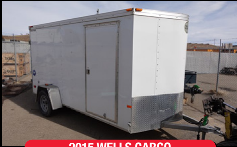
2015 WELLS CARGO