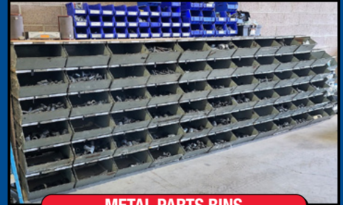
METAL PARTS BINS