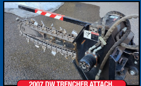
2007 DW TRENCHER ATTACH.