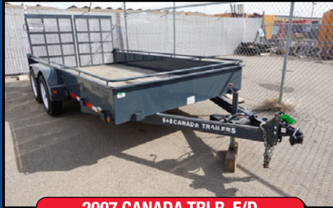
2007 CANADA TRLR. F/D