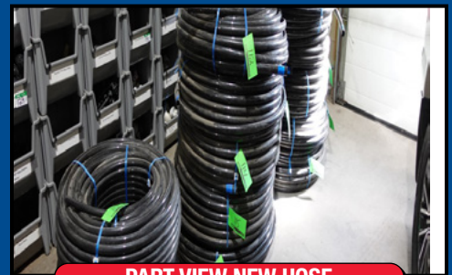
PART VIEW NEW HOSE