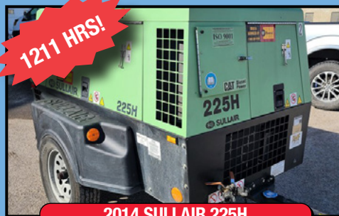
2014 SULLAIR 225H