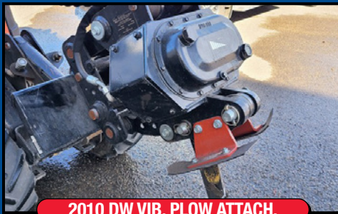
2010 DW VIB. PLOW ATTACH.