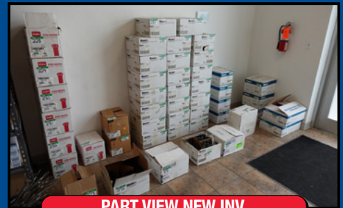
PART VIEW NEW INV.