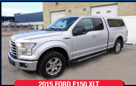
2015 FORD F150 XLT