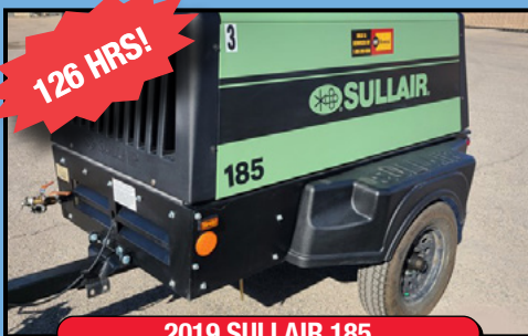
2019 SULLAIR 185