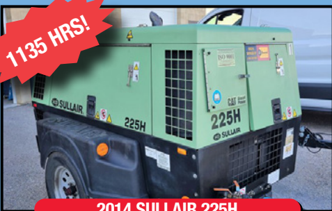
2014 SULLAIR 225H