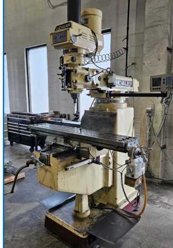
CHEVALIER FM-4VKH VERTICAL MILL