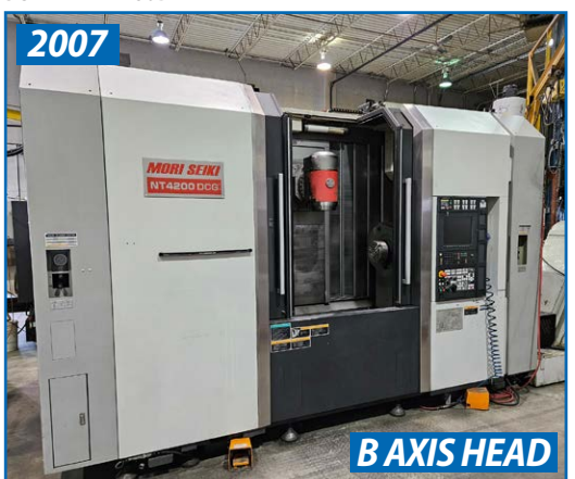
MORI SEIKI NT4200/1000S MULTI AXIS CNC MACHINING CENTER