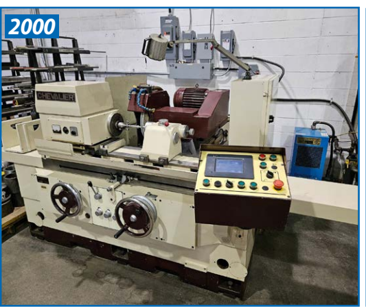
CHEVALIER CG-1224A CYLINDRICAL GRINDER