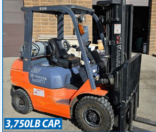
TOYOTA 7FGCU25 FORKLIFT