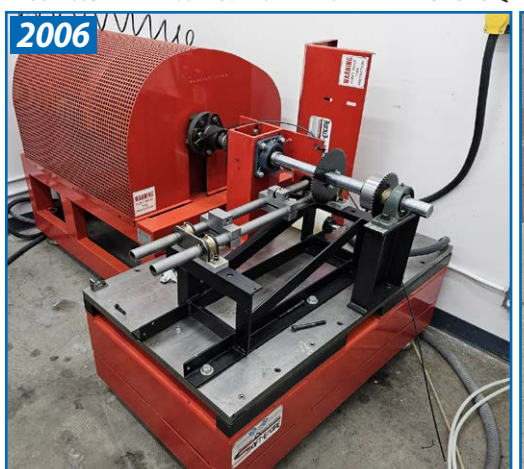
SOFT-ENGINE BRAKER ENGINE 150 DYNAMOMETER