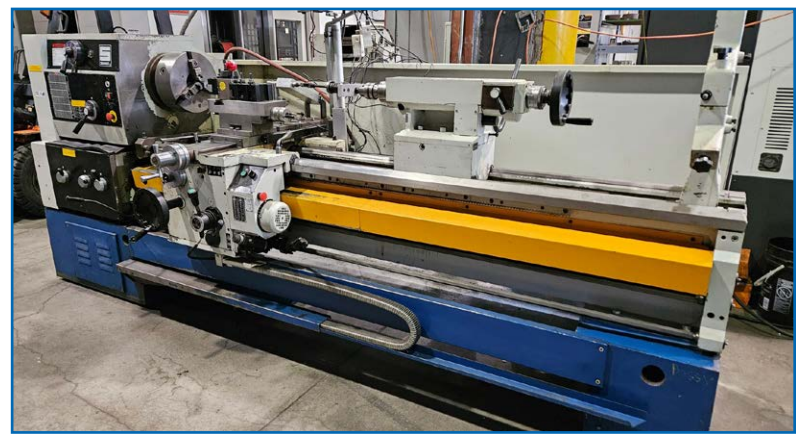
SUMMIT 24X80B LATHE