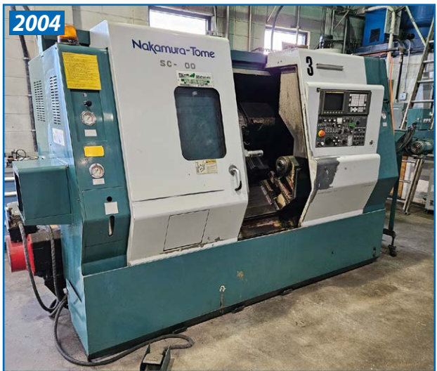
NAKAMURA-TOME SC-300 CNC TURNING CENTER