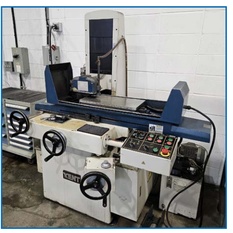
KENT KGS-250A11D HD GRINDER