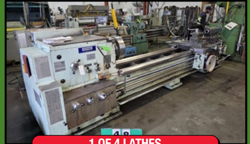
1 OF 4 LATHES