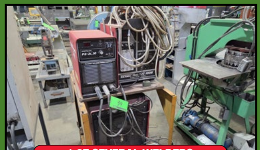
1 OF SEVERAL WELDERS

VISIT www.joinersales.com FOR MORE PHOTOS AND INFORMATION