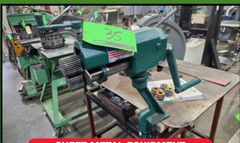
SHEET METAL EQUIPMENT