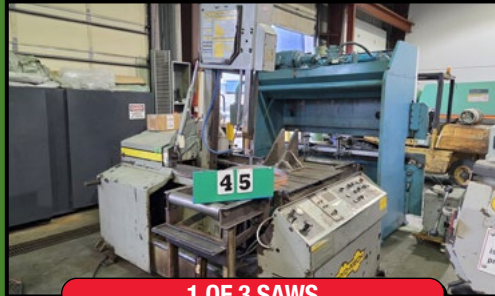
1 OF 3 SAWS