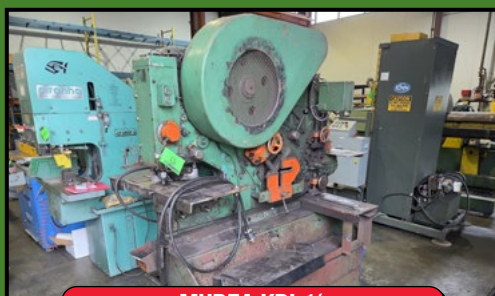
MUBEA KBL 1/2