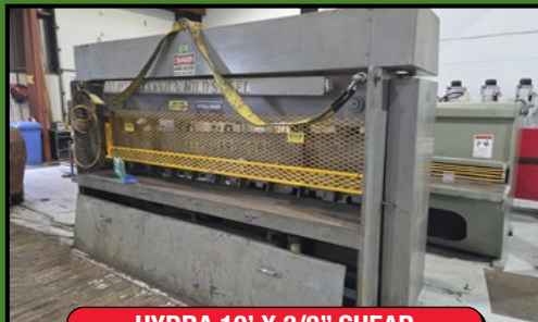
HYDRA 10' X 3/8" SHEAR