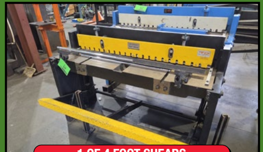
1 OF 4 FOOT SHEARS