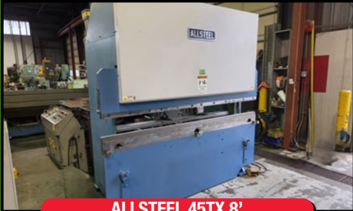
ALLSTEEL 45TX 8'

PLACE: 1385 KINGSWAY AVE., PORT COQUITLAM, BC • PREVIEW: WED., AUG. JUNE 24TH - 9AM TO 4 PM