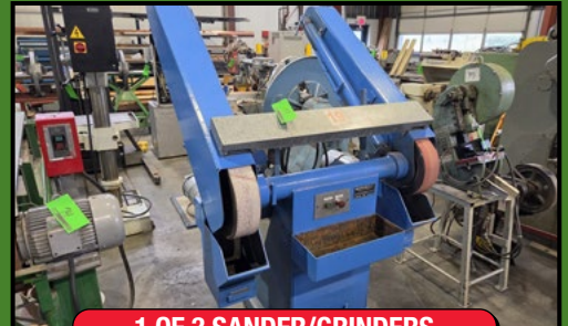
1 OF 3 SANDER/GRINDERS