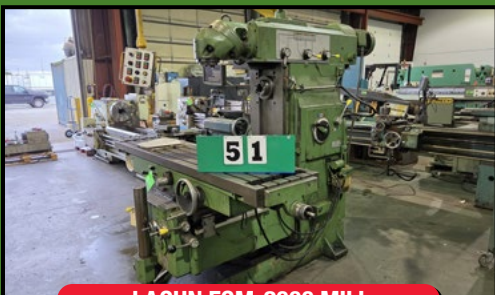
LAGUN FCM-2000 MILL