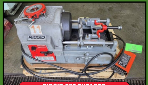
RIDGID 535 THEADER