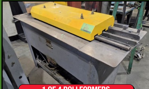
1 OF 4 ROLLFORMERS