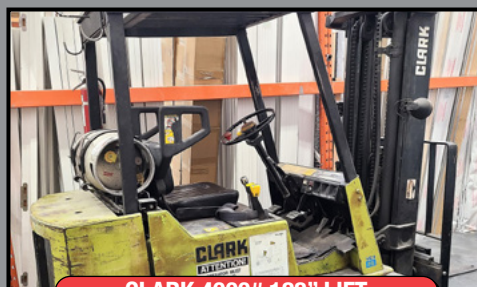
CLARK 4000# 188" LIFT