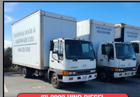
(2) 2003 HINO DIESEL