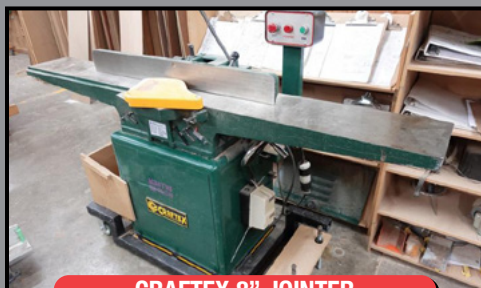
CRAFTEX 8" JOINTER