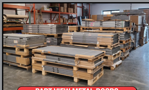
PART VIEW METAL DOORS