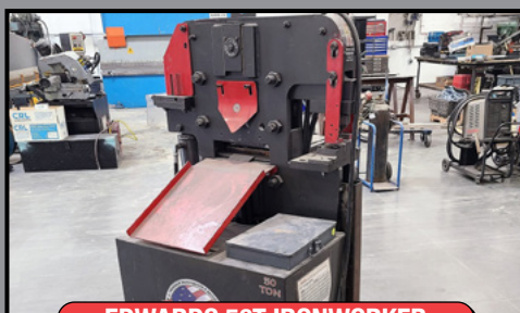
EDWARDS 50T IRONWORKER