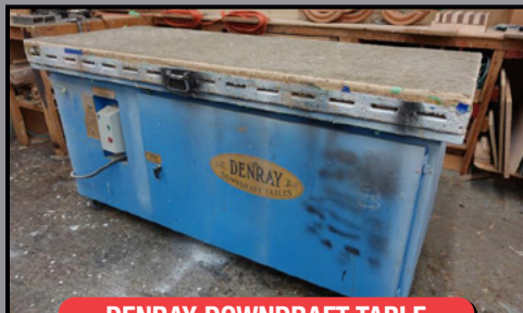
DENRAY DOWNDRAFT TABLE