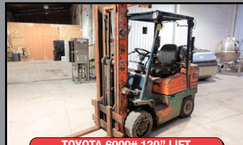
TOYOTA 6000# 130" LIFT