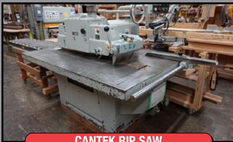
CANTEK RIP SAW