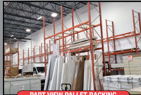
PART VIEW PALLET RACKING