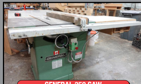
GENERAL 350 SAW