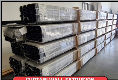
CURTAIN WALL EXTRUSION