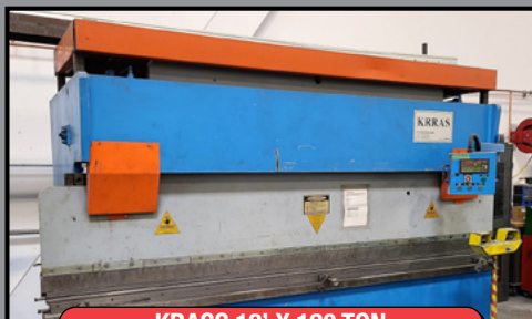
KRASS 12' X 120 TON

PLACE: #120 - 27426 60TH AVE., LANGLEY, BC • PREVIEW: WED., MAR. 15TH, 2023 - 9AM TO 5 PM