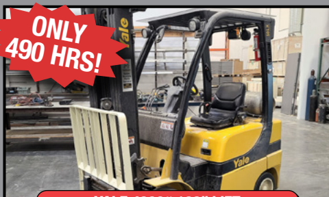
YALE 4800# 188" LIFT