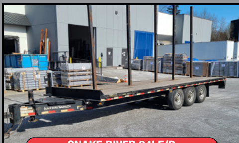
SNAKE RIVER 24' F/D