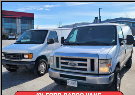
(2) FORD CARGO VANS