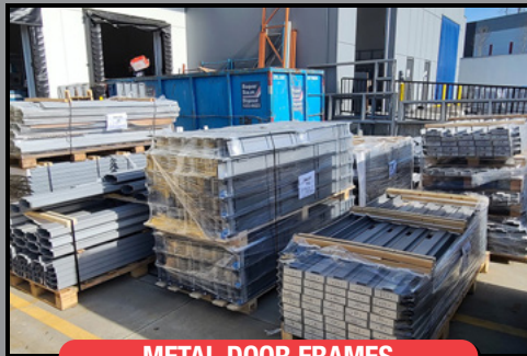
METAL DOOR FRAMES