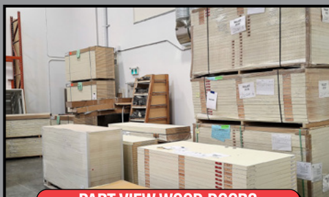
PART VIEW WOOD DOORS