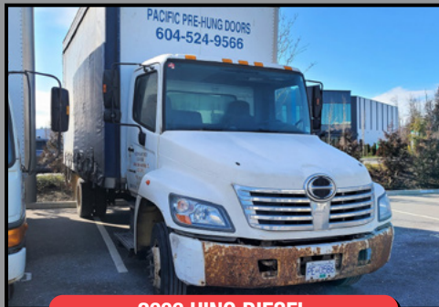
2006 HINO DIESEL