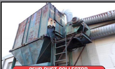
25HP DUST COLLECTOR