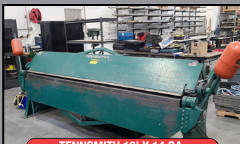
TENNSMITH 12' X 14 GA.