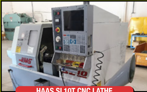
HAAS SL10T CNC LATHE