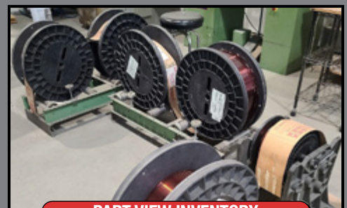
PART VIEW INVENTORY

UNABLE TO ATTEND? Bid from your office in real time via the internet.