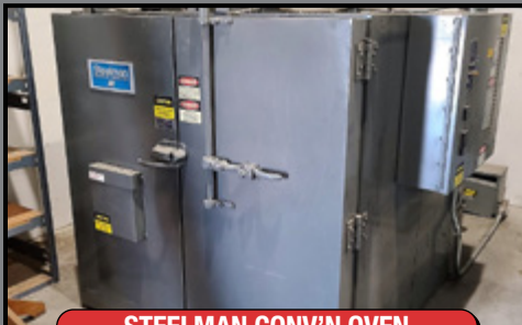
STEELMAN CONV'N OVEN