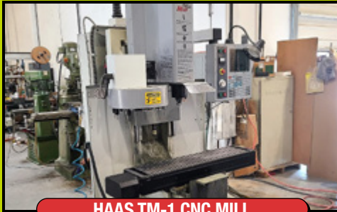
HAAS TM-1 CNC MILL