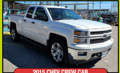
2015 CHEV CREW CAB