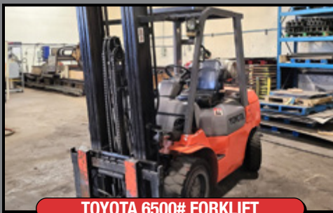
TOYOTA 6500# FORKLIFT