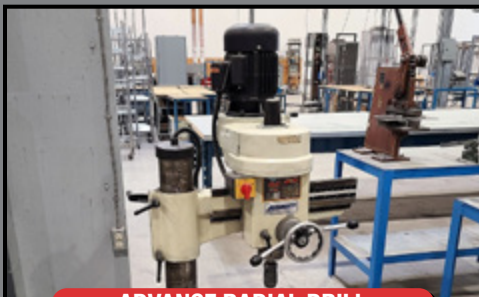
ADVANCE RADIAL DRILL