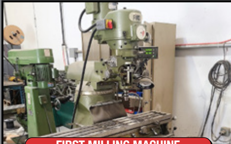
FIRST MILLING MACHINE