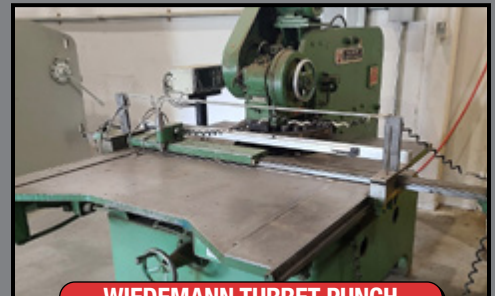
WIEDEMANN TURRET PUNCH