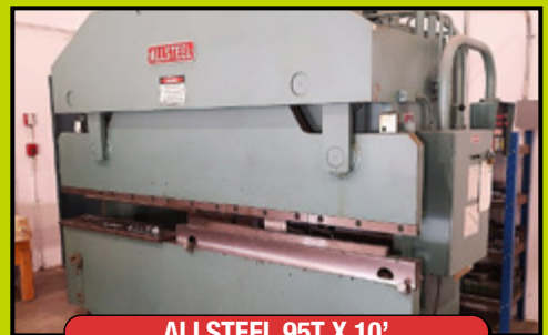
ALLSTEEL 95T X 10'