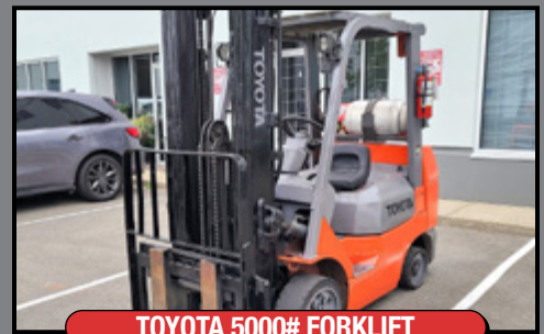
TOYOTA 5000# FORKLIFT