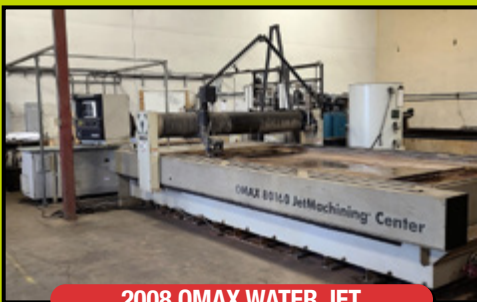
2008 OMAX WATER JET

FIRST LOT BEGINS CLOSING: TUES., SEPT. 21ST, 2021 - 10 AM PLACE: 11828 MACHINA WAY, RICHMOND, BC • PREVIEW: MON., SEPT. 20TH - 9AM - 4PM