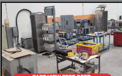
PART VIEW TEST DEPT.