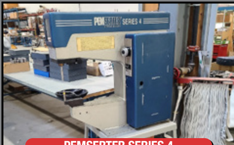
PEMSERTER SERIES 4