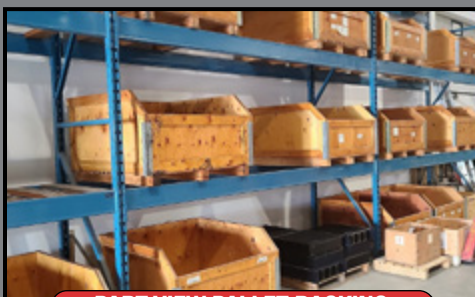
PART VIEW PALLET RACKING