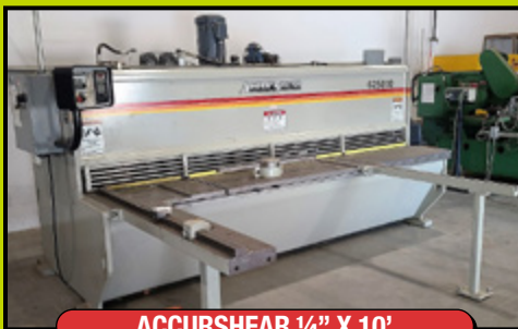
ACCUR SHEAR 1/4" X 10'