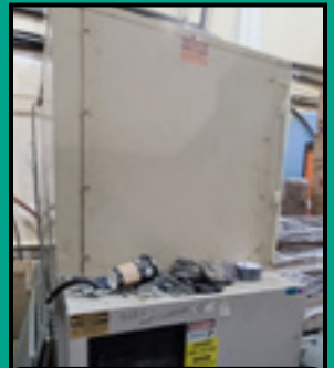
1 OF 3 CHILLERS