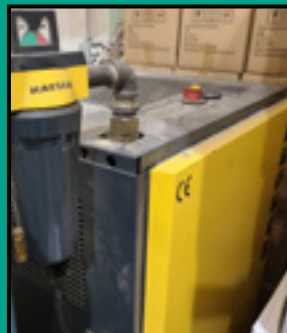
KAESER AIR DRYER