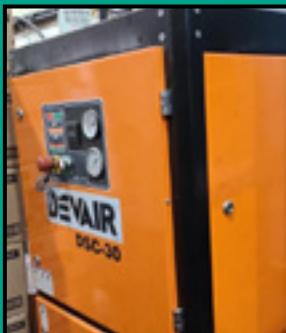
DEVAIR 30HP SCREW