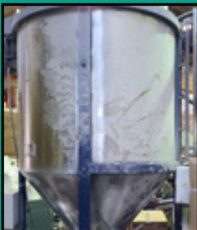
1 TON MIXER