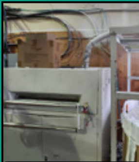
SCRAP SHEET GRINDER