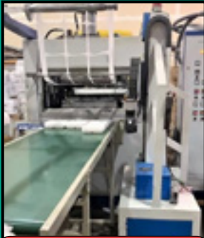
2012 SINOPLAST WS660C FORMER

PLACE: 14093 #2 13015 84TH AVE., SURREY, BC CANADA • PREVIEW: TUES., MAY 24TH - 9AM – 4PM