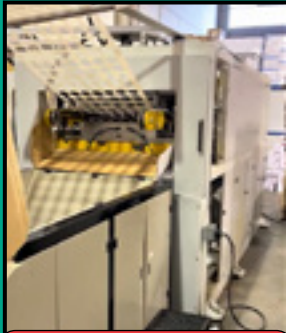
2015 SINOPLAST SPC660C FORMER