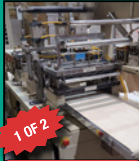
2015 SINOPLAST APT470