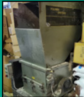
POLYMER 1120 SPL GRINDER