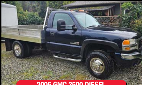
2006 GMC 3500 DIESEL