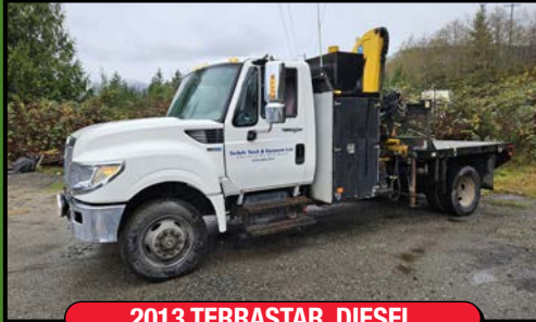
2013 TERRASTAR, DIESEL