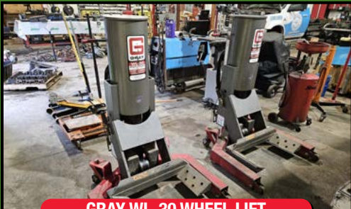
GRAY WL-30 WHEEL LIFT