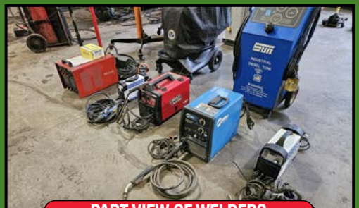
PART VIEW OF WELDERS

VISIT www.joinersales.com FOR FULL DETAILS & PHOTOS ONLINE WITH BidSpotter