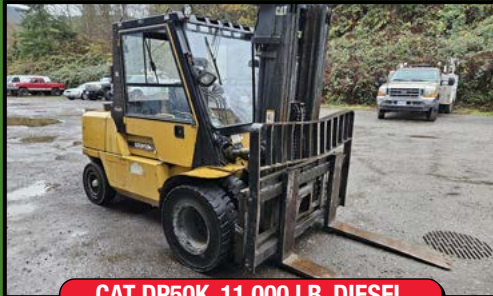
CAT DP50K, 11,000 LB, DIESEL