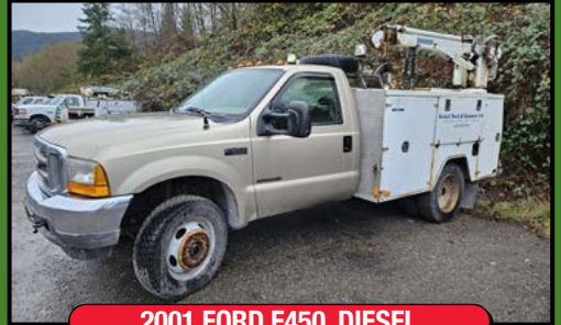
2001 FORD F450, DIESEL