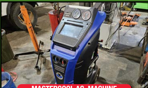
MASTERCOOL AC MACHINE