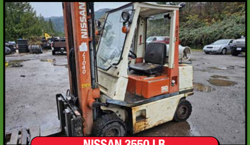
NISSAN 3550 LB