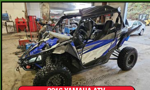
2016 YAMAHA ATV