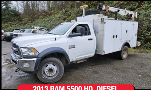
2013 RAM 5500 HD, DIESEL

PLACE: 5480 SECHELT INLET CRES., SECHELT, BC • PREVIEW: WED., DEC. 17TH - 9AM TO 4 PM