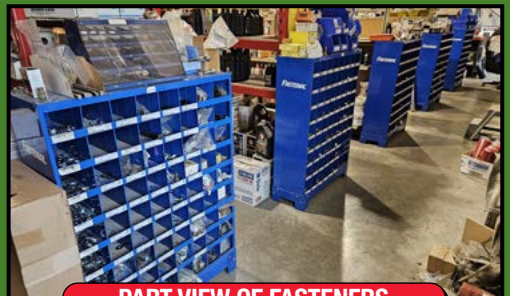
PART VIEW OF FASTENERS