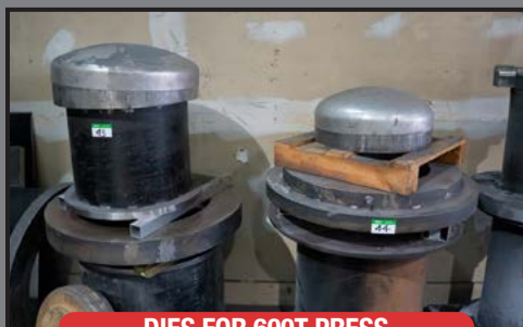
DIES FOR 600T PRESS