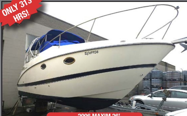
2006 MAXIM 26'