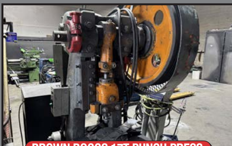
BROWN BOGGS 17T PUNCH PRESS