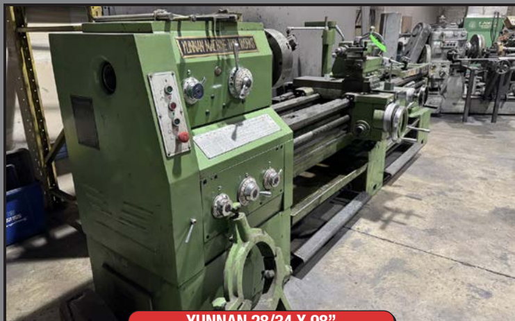
YUNNAN 28/34 X 98"