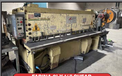
FARINA 8' X 1/4" SHEAR