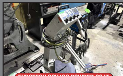
EUROTECH GCJ400 POWDER COAT