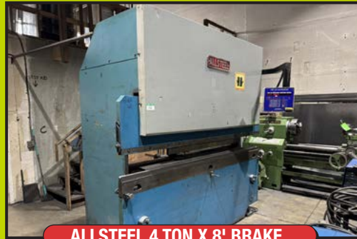
ALLSTEEL 4 TON X 8' BRAKE