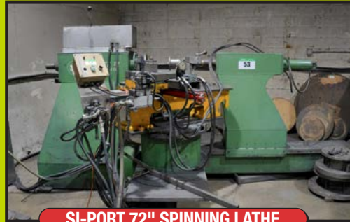
SI-PORT 72" SPINNING LATHE