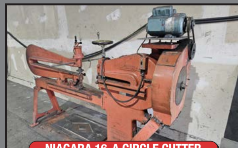
NIAGARA 16-A CIRCLE CUTTER

SELLING OUT? SURPLUS EQUIP? NEED AN APPRAISAL?