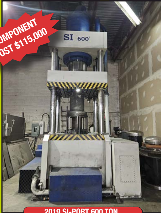
2019 SI-PORT 600 TON