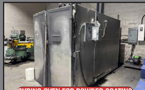
CURING OVEN FOR POWDER COATING