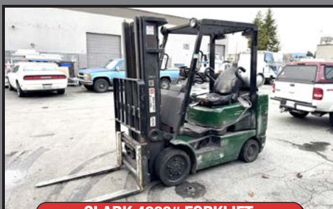
CLARK 4600# FORKLIFT